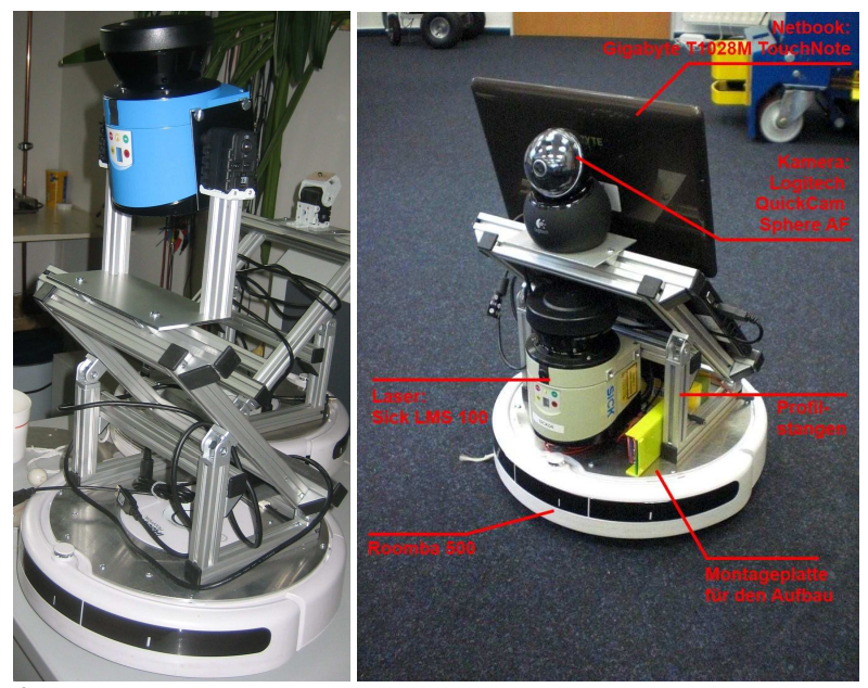
Fig. 2. A modified version of a Roomba. Left: With a 3D laser range finder. Right: With a 2D laser range finder, a pan and tilde camera and a notebook with touch display. A video of an example student project can be found at: http://www.youtube.com/watch?v=SFZtYkA hcU

lecture the practical work with the robots and sensors has to be done. The Robot Operating System (ROS) [5] is the robot control architecture and middleware used, and has to be installed by the students in the first lessons. Exercises with the laser range finder and cameras have to be passed and example nodes i.e. publishers and subscribers have to be implemented. During the last third of the lecture small individual student projects have to be worked out in small groups.