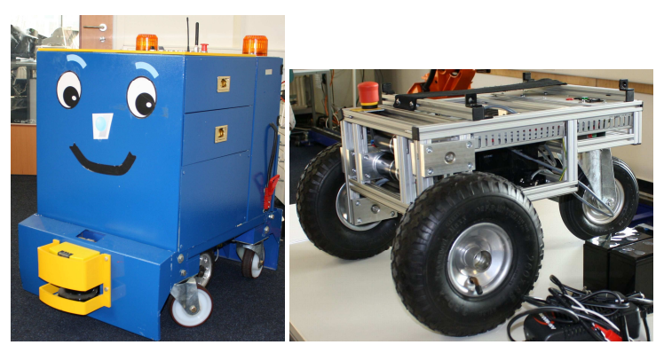
Fig. 3. Left: Handycart with a Sick PLS laser range finder. Right: A Volksbot RT3 controlled by a MacMini.

The concept could not be really evaluated since the course just started or given only once. Nevertheless the first evaluations from the students are very promising.